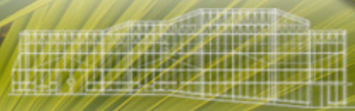
Image 1 - Collection: not recorded - not recorded / n°SIB 446572/1